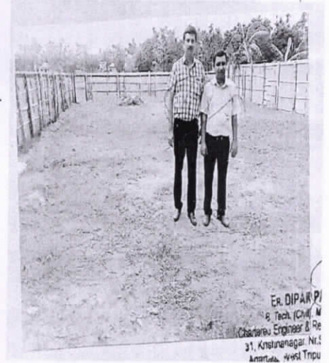
PHOTO OF THE PROPERTY